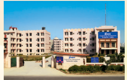
JIMS Engineering Management Technical Campus Greater Noida, U.P.