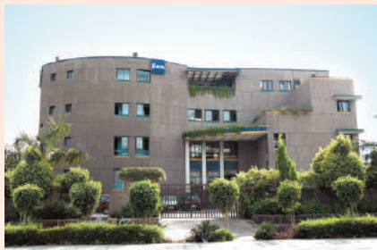
Jagan Institute of Management Studies Sector-5, Rohini, New Delhi