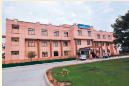
Jagan Institute of Management Studies Jaipur, Rajasthan