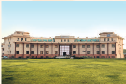
JaganNath Gupta Institute of Engineering and Technology Jaipur, Rajasthan