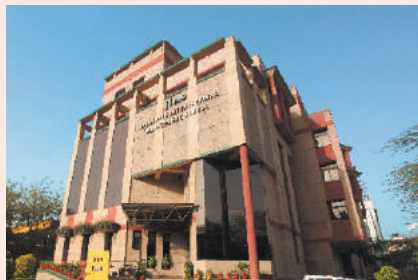
JaganNath International Management School Kalkaji, New Delhi